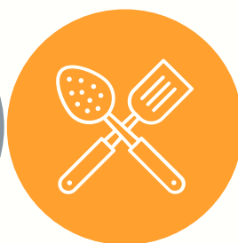
CHEMISTRY IN THE KITCHEN