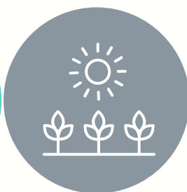
AG IN THE CLASSROOM