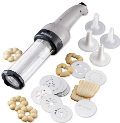
Pastry Press — Any type of press used to shape or mold cookies.