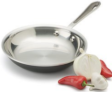
Frying Pan — A pan used for frying foods with a single long side handle, measured in inches and may have either straight or sloped sides.