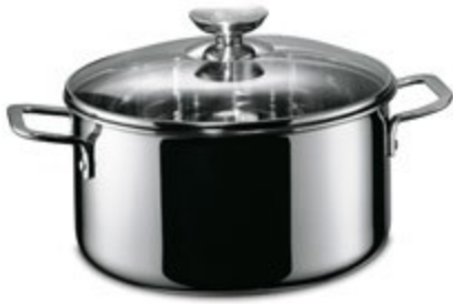
Dutch Oven — An iron container with lid used for cooking stews or casseroles.