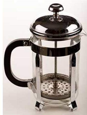
French Press —French press (also press plunger pot , press coffee , coffee pusher , French Press , plunger pot ) is a glass container for making coffee. Hot water is poured onto the coffee grounds, a punch having a sieve is pushed down, keeping the solids at the bottom. It can also serve as a serving pot when the finished coffee is consumed quickly.