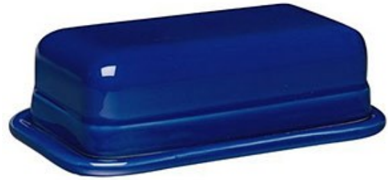
Butter Dish — A small dish with cover used to store and serve butter.