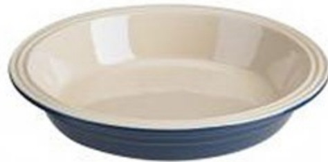
Pie Plate — A plate used to serve pie.