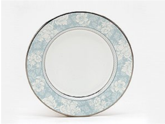
Bread Plate — A small plate used to hold bread while eating