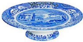
Cake Platter —A cake platter is a large serving plate for desserts. The shape is often round, but it may enough to hold virtually any shape and size of cake except maybe a bigger sheet cake. be square or rectangular. It's usually made large