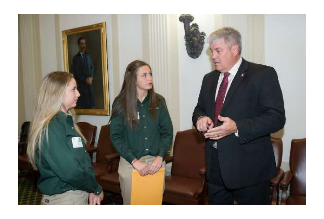
4-H Day at the Capitol