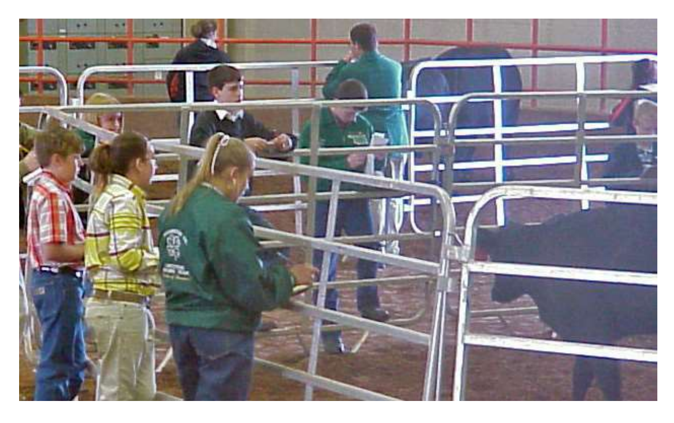
Through judging activities