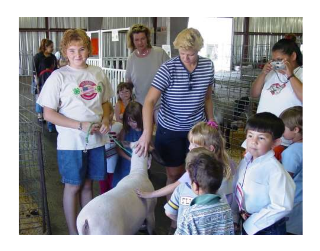
Sharing project work and running for office