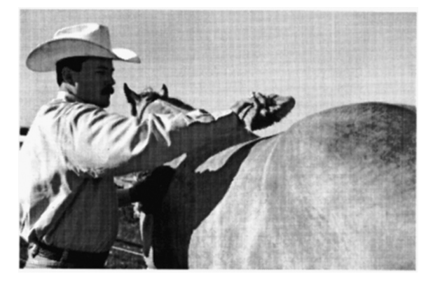
Be sure that the horse's back and girth areas are free from debris.

Step 2. Check the Saddle and Pad. When preparing to saddle the horse, always check your equipment to make sure everything is in good working order. Check the saddle