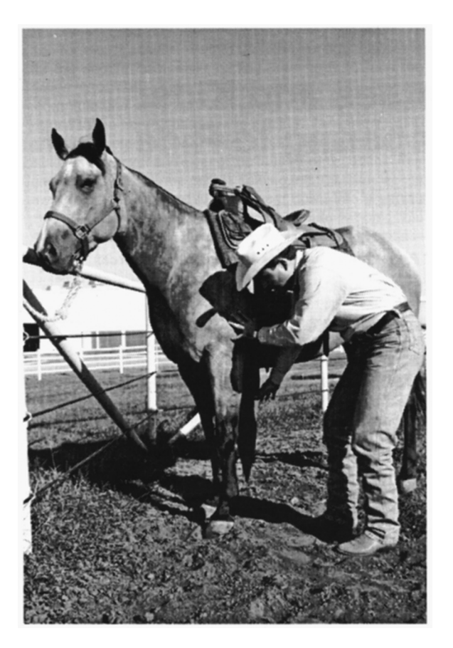
Reaching for the cinch with the right hand wil help ensure your head is away from the horse's hind legs.

the right hand to catch the girth. This helps to keep your head away from the horse's hind legs. Before cinching, pull the girth up against the horse to see if he is going to object to the pressure. If the horse objects, check your equipment and ask for help from an experienced rider.