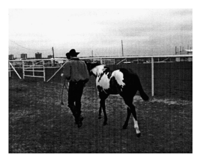
When leading a horse walk even with his throatlatch.

ing directions. Never allow the horse to walk too far in front or behind. When changing direction more than 90 degrees, turn to the right to lessen the chance of getting stepped on. Read Oklahoma 4-H member fact sheet no. 623, Showmanship at Halter, for more information on safely leading a horse.