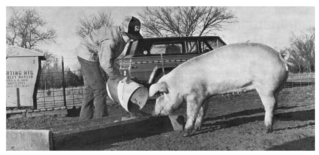
A 4-H member hand feeding his gilt a balanced ration.

breeding time (7 to 8 months of age) gilts should be limit fed so they will weigh 250 to 275 pounds at breeding time.