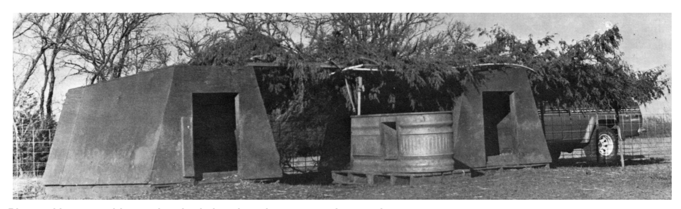
Plywood houses with a cedar shade break and an automatic watering system