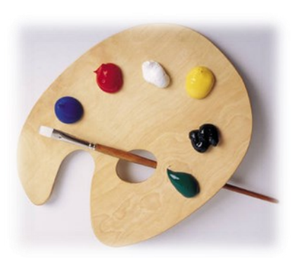
The <u>PROCESS</u>, not the product , is the key in making crafts.